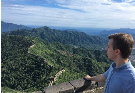
View from the Great Wall

the City, so it seemed as if we had been transported to a serene countryside setting when we entered. After exploring the vast maze of courtyards and museums in the City, we left to travel to nearby Tiananmen Square, where some of the main government buildings were located alongside Mao Zedong's mausoleum. The day was completed with a trek across the city centre to an older district, where we visited a traditional Chinese tea room and sampled a variety of local brews.