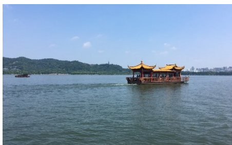
Boat on Hangzhou west lake

After the weekend, we travelled back to Shanghai and moved to a new school nearer to the city centre, where we were to repeat the teaching program again with a new group of students. This school was considerably more spartan and the class sizes increased, although by now we were accustomed to our teaching duties, so we took it in our stride.