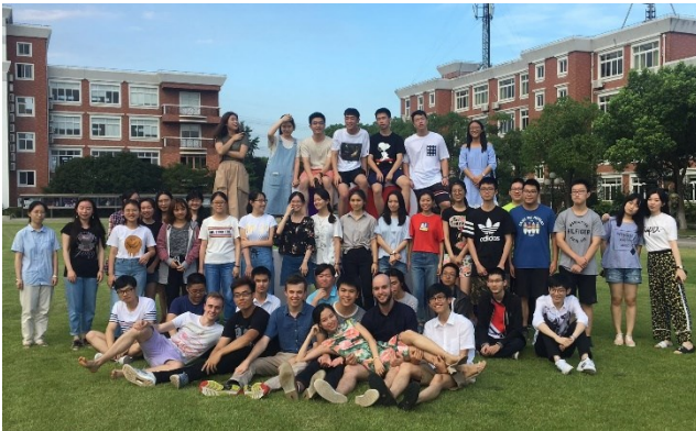
Students, interns and staff at ULink campus

After the first week concluded, it was time to start teaching. My first role was as a general maths teacher, providing a refresher course in calculus and graph sketching to the maths and engineering groups. I was put in sole charge of a class of 26 students and tasked with delivering three-hour lessons every morning, followed by personal statement consultation sessions in the afternoons. I suddenly became very busy with preparing classwork, homework, tests, solutions and teaching material for all my lessons – most of my second week was devoted to this work. Although I was nervous at first, I quickly acclimatised and became more confident as the week progressed – I especially felt that my ability to improvise and communicate with the class improved as the days went by. I rather enjoyed reading the students' test results every day and seeing how well they'd understood my teaching, especially when I introduced completely new or challenging topics. One of the quirks of the program was that students would provide feedback on the teachers every day, just to keep us on our toes, so I did feel under pressure at times; thankfully my feedback was usually good!