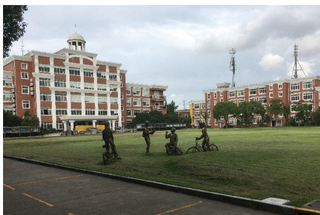
ULink campus – the first school I worked in

I flew into Shanghai Pudong airport late on a Monday evening and travelled to an English language school on the outskirts of Shanghai, which was where I was to be based for the first four weeks in China. The next day, I woke at 9am to meet the other Oxbridge interns and begin our week of orientation training, to help us acclimatise and develop our teaching skills in preparation for the weeks ahead. I had almost zero prior experience of classroom teaching and yet in only a few days I was to