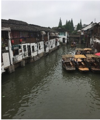
Zhujiajiao water town

Some of the other places we visited that week included the Zhujiajiao water town, a settlement on the edge of Shanghai famous for its waterways and Buddhist temples, and the Shanghai propaganda museum, which features a selection of communist propaganda posters from the mid to late 20 th Century. We also took time to experience the city's nightlife, including Karaoke, clubbing and street food. Chinese karaoke, known as KTV, was very popular in Shanghai and there were many places to hire a private room for an evening of (unfailing poor) karaoke singing. This quickly became our favourite activity and we would end up booking a late-night session nearly every week, often despite the fact we were teaching at 9am the next morning!