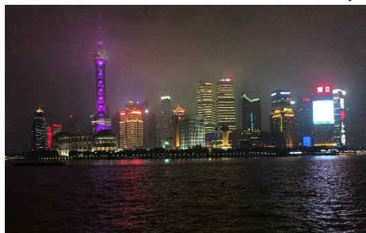
Shanghai City skyline (Pudong district)

The first place we visited was the old town in Songjiang district, a series of winding alleyways filled with traditionally designed Chinese stalls and restaurants. The next evening, we travelled to the city centre for my first experience of Chinese fine dining, eating at a Peking Duck restaurant. Afterwards we took a ferry across the river to the Shanghai financial district, where