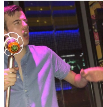
Enjoying a KTV session

Some of the other places we visited that week included the Zhujiajiao water town, a settlement on the edge of Shanghai famous for its waterways and Buddhist temples, and the Shanghai propaganda museum, which features a selection of communist propaganda posters from the mid to late 20 th Century. We also took time to experience the city's nightlife, including Karaoke, clubbing and street food. Chinese karaoke, known as KTV, was very popular in Shanghai and there were many places to hire a private room for an evening of (unfailing poor) karaoke singing. This quickly became our favourite activity and we would end up booking a late-night session nearly every week, often despite the fact we were teaching at 9am the next morning!