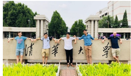
Entrance to Tsinghua University

I spent my final day in Beijing visiting Tsinghua University campus, one of China's most prestigious universities, before taking a train back to Shanghai. It wasn't long before I set off again on the way to my final destination: The Shaolin Temple, the place that is regarded to be the birthplace of Kung Fu. To reach it I had to travel far inland