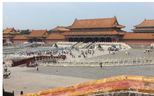
The Forbidden City

After the seventh week concluded and the teaching program had ended, I set off on a much-anticipated journey to the city that proved to be the highlight of the trip: Beijing. Along with a small group of interns, I travelled 1300km north from Shanghai on a bullet train, late on a Friday evening. We eventually arrived at our accommodation, a small run-down apartment on the city outskirts, before setting out the next day to the Forbidden City, a centuries old terracotta complex in the centre of the city. Strict planning permission prevented most construction in the area surrounding