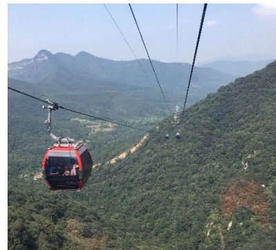
View from Mt. Song cable car

The next day I travelled back to Shanghai to catch a plane to Hong Kong, where I spent the next week visiting friends before heading back to the UK in early September. I look back on my eight weeks spent in China as some of the best moments in my life, both because of the places I visited and the friends I made while I was there. I am incredibly grateful to have received the Girton Travel Scholarship, as it enabled me to experience China