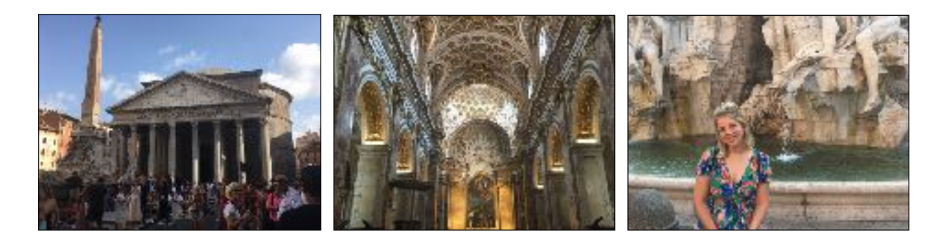
Day 2 - The Vatican City

Along with a course-mate, I began my journey to Rome on the 1st July. Having awoken before the sun had made its appearance, we boarded the plane with bleary eyes and full of (somewhat sleepy) excitement about what we would discover during our week. We arrived at Rome Ciampano airport and quickly became accustomed to the Italian public transport and the midday heat as we made our way into the city centre by bus and tram to find our apartment nestled within a street of colourful flats and tiny Italian cars. Once we had settled into our apartment and visited the local supermarket to stock up on groceries for the week, we set out to find much-needed local coffee and to explore the centre of Rome. Following the bustling, windy streets, we turned a corner into the Piazza della Rotondo and were taken aback by the sight of the enormous Pantheon which dominated the square. We explored this once-pagan-temple (more recently converted to a church) along with a number of other beautiful ancient churches until our feet were pleasantly sore. Over our first taste of true Italian pasta, we sat down to plan how we could best spend the next 6 days and realised how much there was to do and see! Once a plan had been made, we returned to apartment to appreciate our air-conditioning and get a good night's sleep ready for the next day for the first of our Paul-adventures.