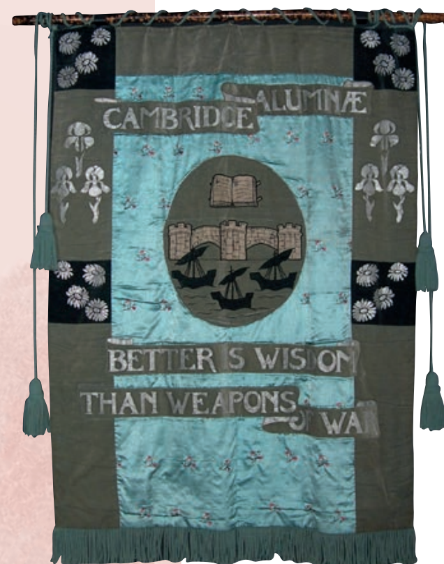
Cambridge alumnae Suffragette banner

“There is structured support in place for both academic and health issues should I need it.”