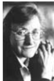
Professor Dame Marilyn Strathern FBA Mistress, Girton College

Girton’s oldest and most vitalising virtue is to look to the future through being aware of the demands of the present.