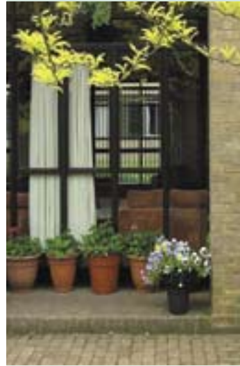
Courtyard: Wolfson Court

Fundraising is well underway to build a pavilion worthy of the sporting triumphs of Girton's