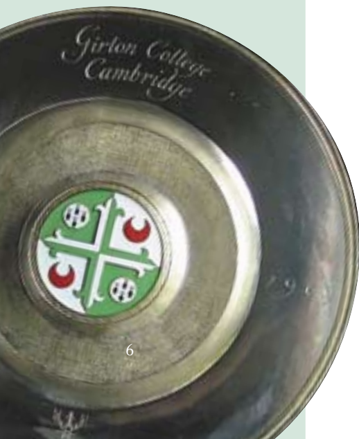
Centrepiece, part of the Power silver collection, Girton College

If you wish to leave money to benefit a specific area of College life, you may wish to discuss the wording with a member of the College’s Development Office, or with the Bursar.